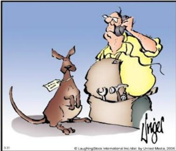
“Why don’t you listen? I said, ‘Send over a can of glue.’”