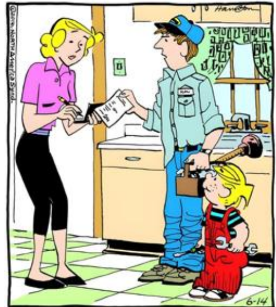
"THANKS TO YOUR SON'S HELP, I WAS ABLE TO GET THE JOB DONE IN TWICE THE TIME."